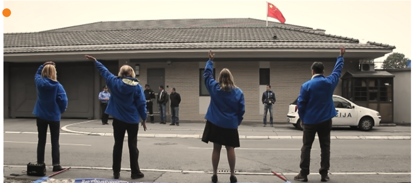
Stills from The Blacklisted